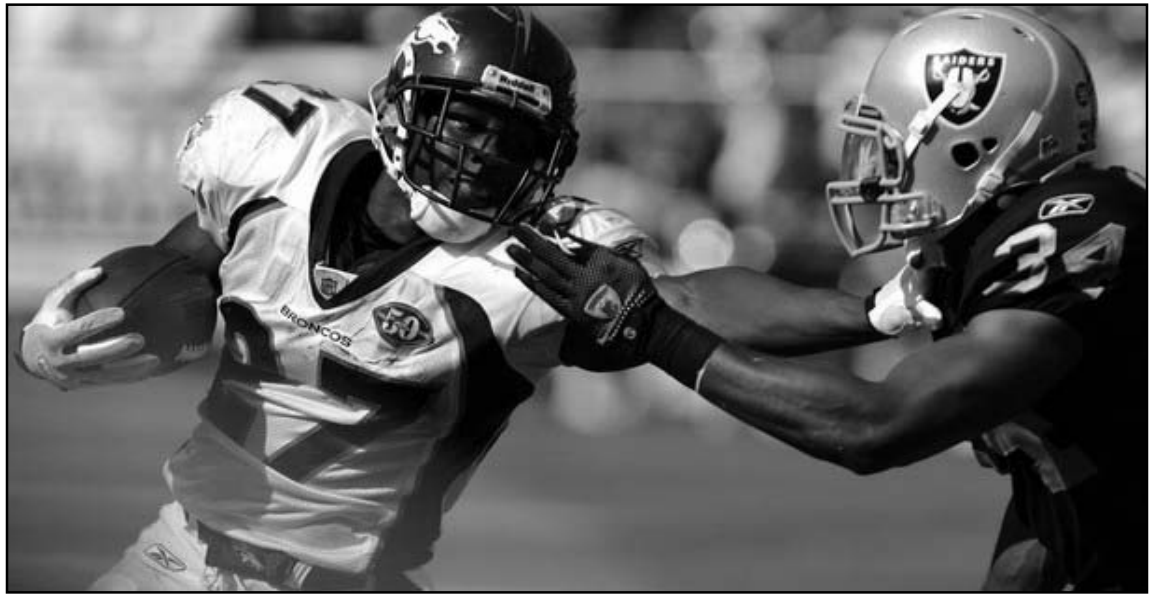
Knowshon Moreno (left, #27) has become an asset to the Broncos. As a high school star at Middletown South, even opponents couldn't hold back from being in awe of his raw talents.

"It makes me feel good to see a guy from our area get