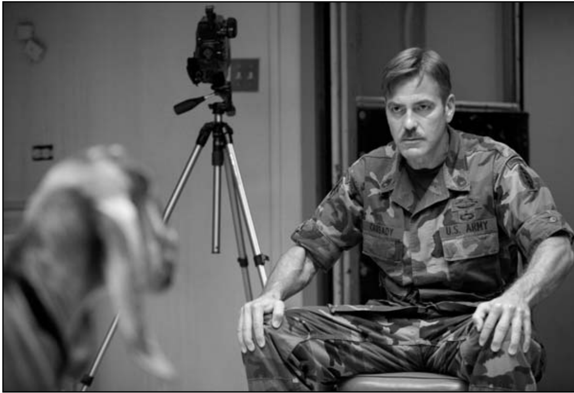
George Clooney as Cassaday shows his abilities by taking down a goat.

McGregor stars as journalist Bob Wilton who flees to Iraq to inexplicably impress his wife, who not only works for the same newspaper as Wilton, but is