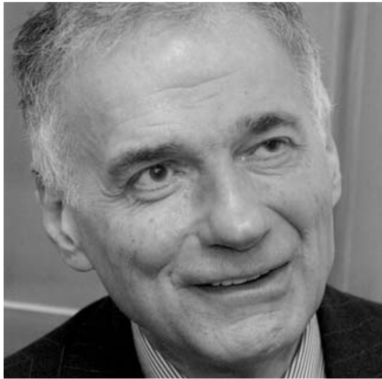
Ralph Nader, who has recently released "Only the Super Rich Can Save Us," will speak at Brookdale on Dec. 5.

Nader has been spreading a message for half a century intending to dent the social structure of our