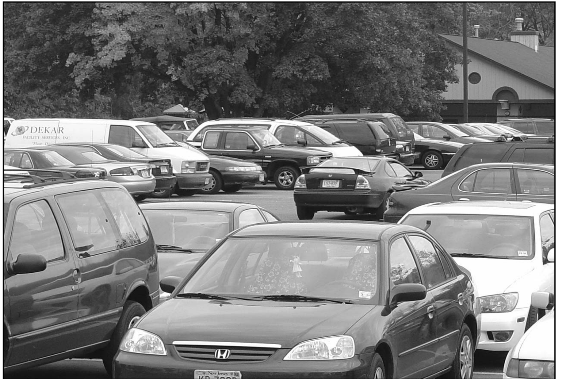
Crowded lots have led to many students being late for class. A select few, however, take the trip to Lot 1. Instead, they continue their search for a spot in more crowded lots such as Lot 5, pictured here.

Nacco also suggested an easy solution to the parking problem. The campuses located outside of Lincroft are consistently increasing the amount of students enrolled, despite a limited number of classes in each building. If a larger variety of courses are available at the Higher Education Centers, this