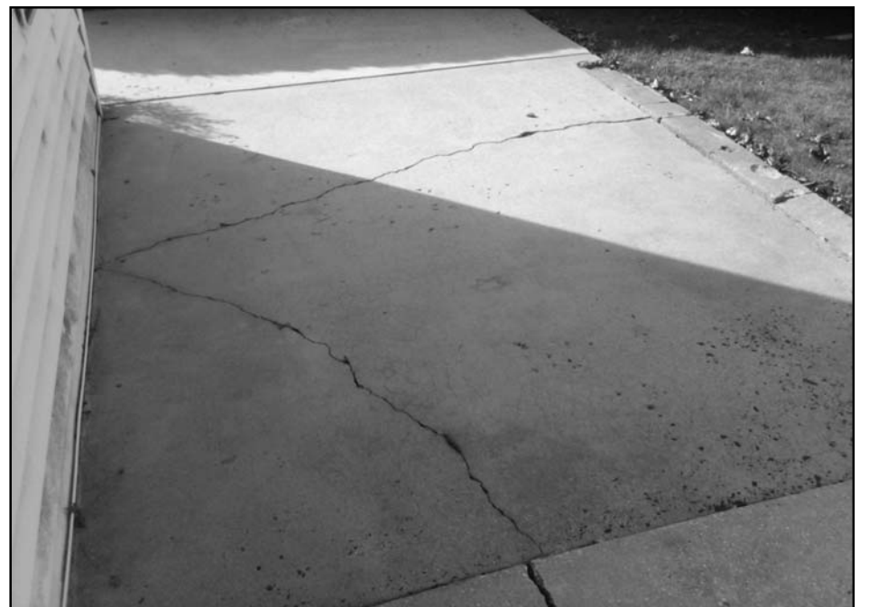
The groundhog's tunneling system has caused damage to several areas of the school. The cracks in this sidewalk, located outside of the BSA building, are an example.

While property damage is a big issue with the groundhogs, a