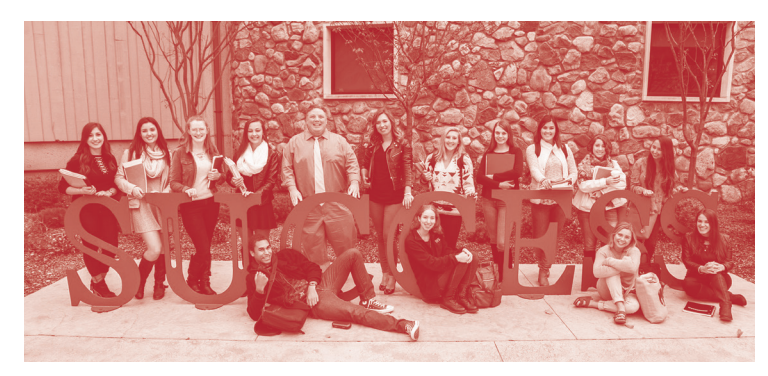
APPLY EARLY! For our application and more visit www.brookdalecc.edu/honors

Students take most of their Honors courses together, allowing them to form a community of engaged learners who support each other throughout their Honors experience. To graduate "With Honors," students must complete 15 credits of Honors coursework during their time at Brookdale. Additionally, they must present a capstone project at the Honors Symposium and graduate with a 3.5 GPA.To earn an "Honors Certificate of Recognition," students must complete 9 credits of Honors coursework and graduate with a 3.5 GPA. Presenting at the Honors Symposium is highly recommended, but not required. The Certificate is a good option for students beginning their Honors studies in their second year.