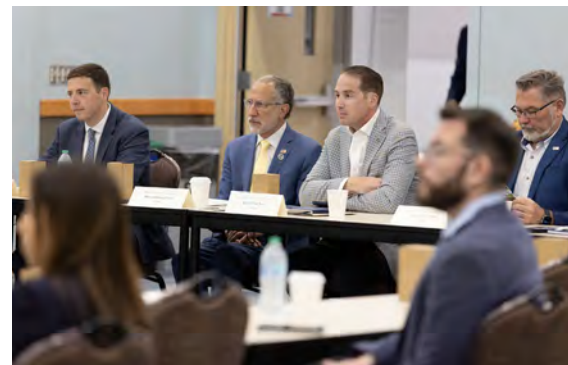
Mayors participating with panel.